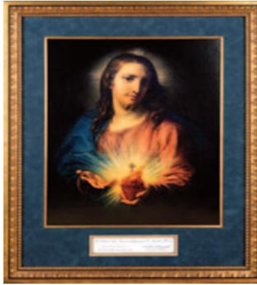
2025- Sacred Heart of Jesus